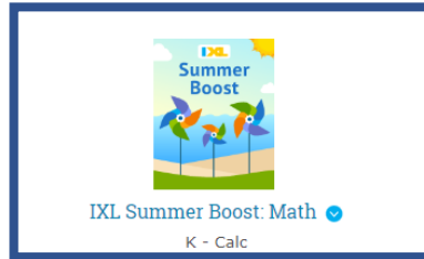
IXL Summer Boost: Math ✓ K - Calc